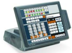
Software Version CITGO 10.0