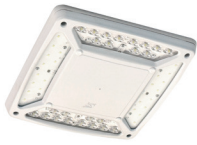
SCOTTSDALE VERTEX (SCV SCFT) ASYMMETRIC/FORWARD THROW

With three different fixtures, the esteemed Scottsdale family of canopy lights offers a variety of high-end features in a sleek, low-profile design, including Forward Throw distribution, serviceability from above and below the canopy, and unequaled energy efficiency.