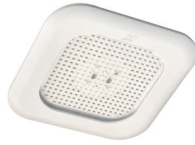
SCOTTSDALE LEGACY (CRUS AC) ASYMMETRIC/FORWARD THROW