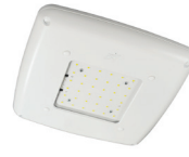
SCOTTSDALE SCM (SCM) STANDARD SYMMETRIC